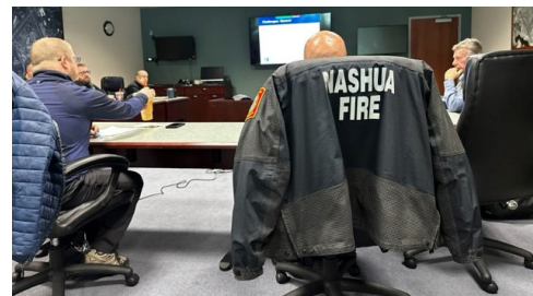
Day 2: Quick Look