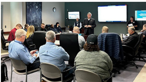
Day 1: TTX

TTX at Manchester-Boston Regional Airport